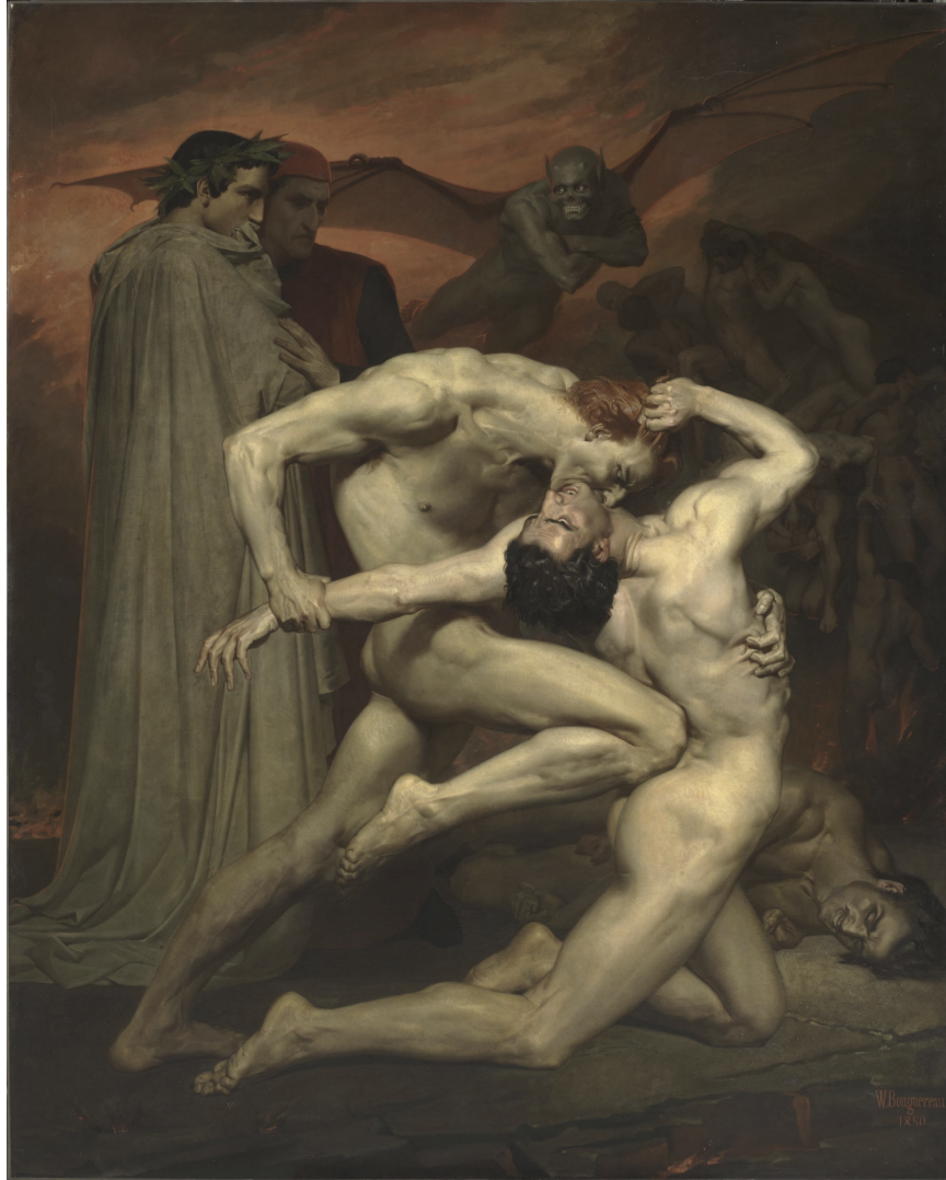
Dante and Virgil in Hell by William A. Bouguereau.