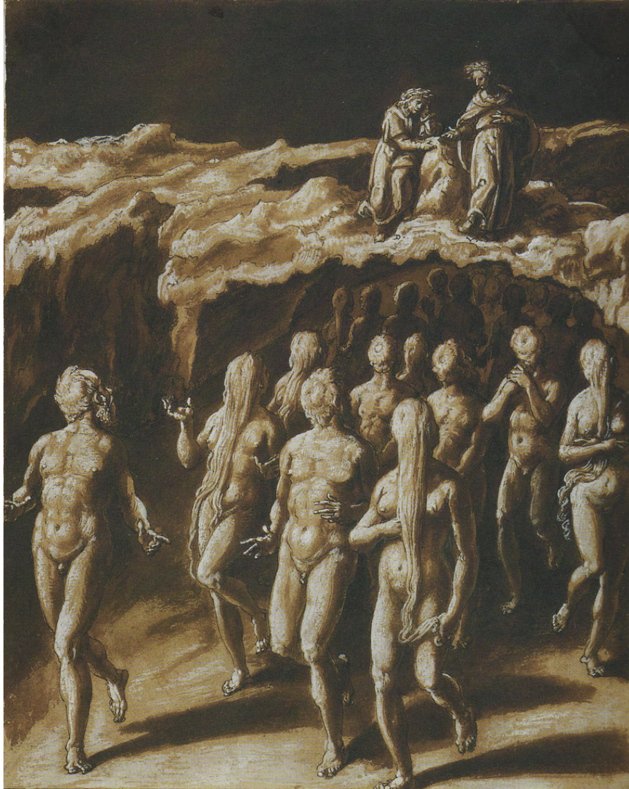
Illustration of Dante's Inferno: Canto 20 by Stradano (Johannes Stradanus)